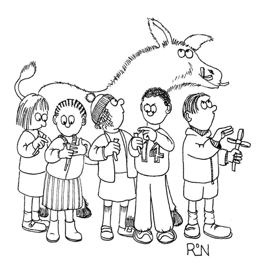
They could have either a procession of crosses, or a donkey. But not both.